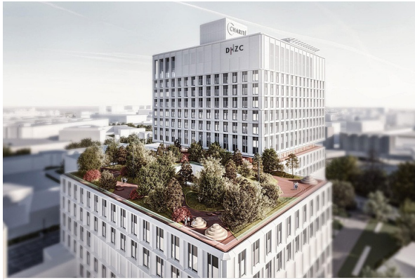
> Kapellmann unterstützt die Charité beim Neubau des Deutschen Herzzentrums