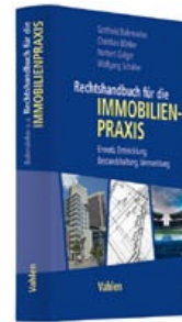
› Rechtshandbuch für die Immobilienpraxis