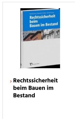
> Rechtssicherheit beim Bauen im Bestand