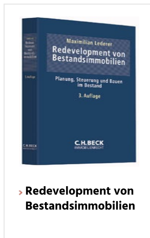
> Redevelopment von Bestandsimmobilien