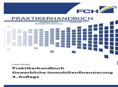
› Praktikerhandbuch Gewerbliche Immobilienfinanzierung