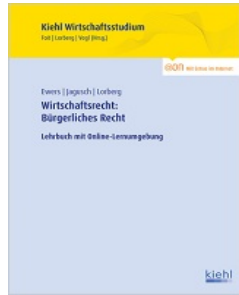
> Wirtschaftsrecht: Bürgerliches Recht