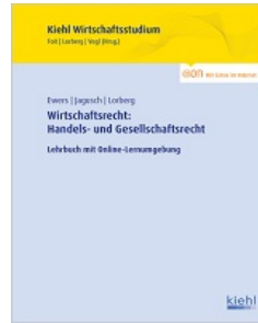
> Wirtschaftsrecht: Handels- und Gesellschaftsrecht